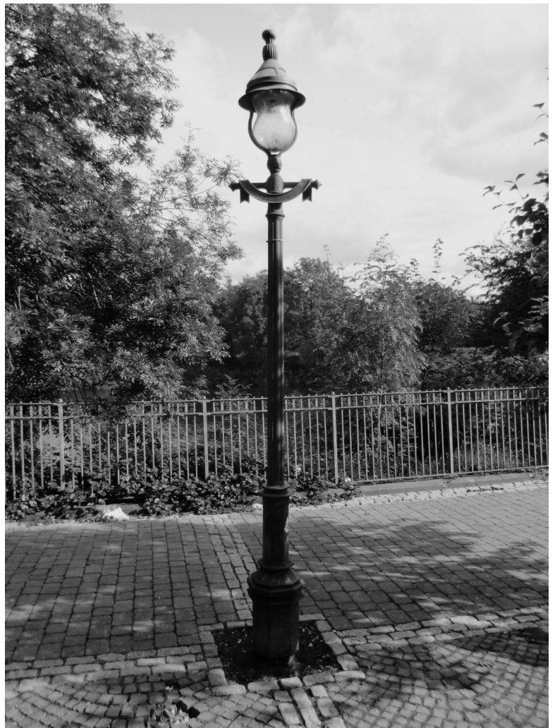
Top: Solitude Bottom Left: Old Town Bottom Right: Lampost